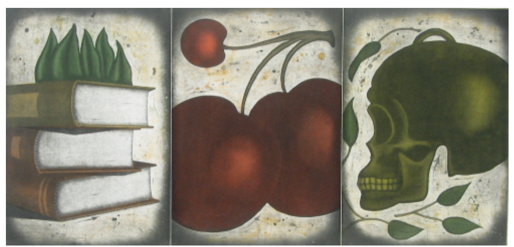
"Myth and Wisdom" (etching)