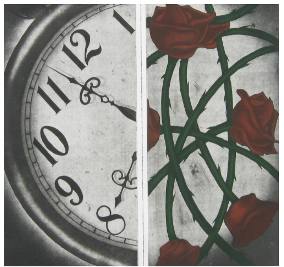
"Memory's End" (etching)