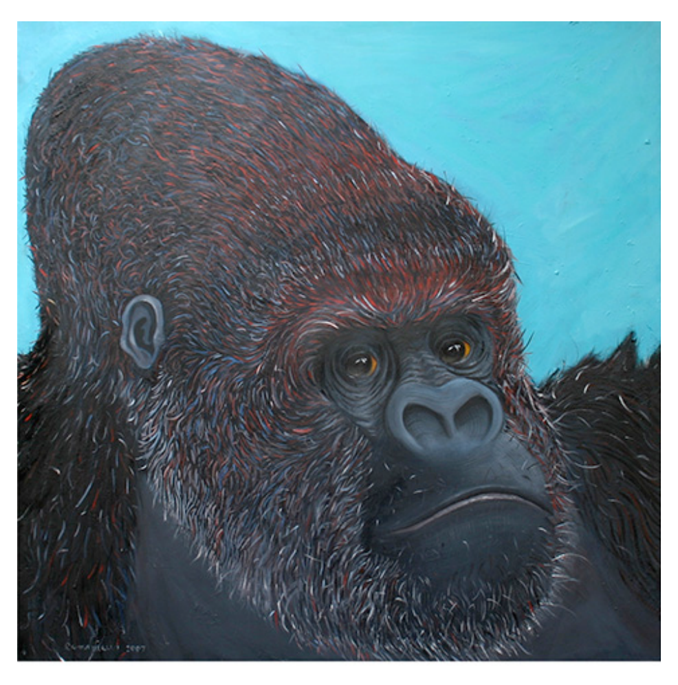
Despair of Gorillas 2007 48*x48 ° Oil on Canvas