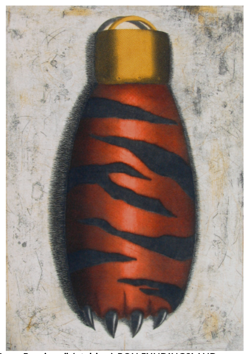
"Cross Bearings" (etching) RON FUNDINGSLAND