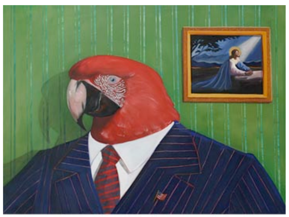
OStephen Romaniello Picture of the Prophet 2007 40"x30" Oil on Canvas