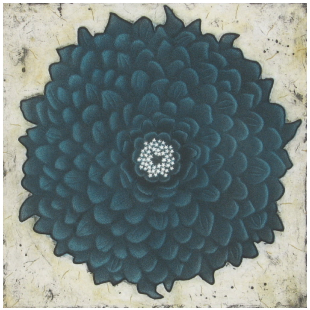
"Blue Zinnia" (Etching)