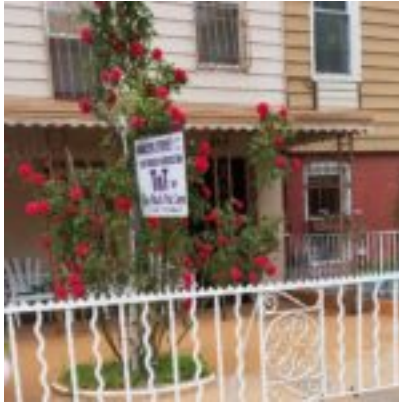
Macon Street, Brooklyn 2020

When I returned to Brooklyn, the sun was bright, my apartment cleaned but utterly rearranged. It was jarring, disturbing, it felt like a violation. The kind person who stayed in my space for a couple of months had tried to make the space her own and that makes sense but she failed to put things back. And all of this was while dealing with the extreme lock down in New York City.