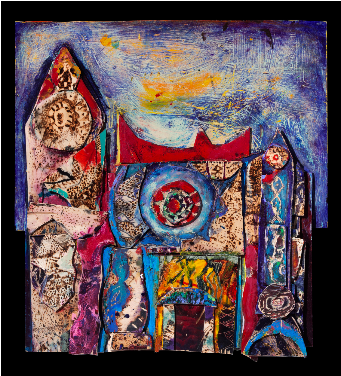
“Guanajuato,” Wood and Acrylic