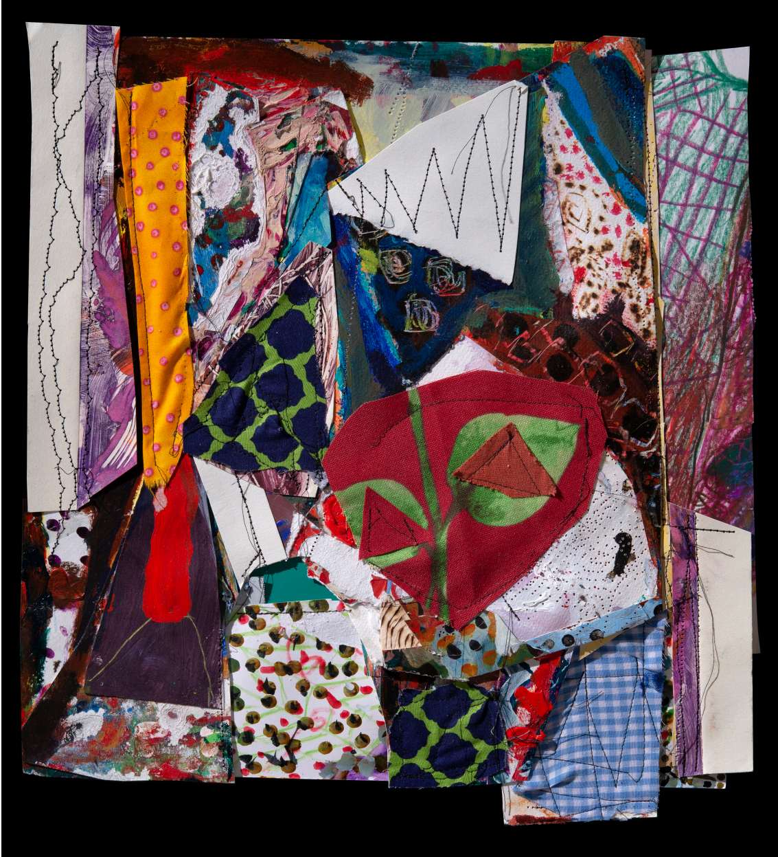
“Moths In The Closet,” textile and acrylic